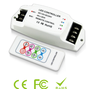
(Please read through this manual carefully before use)