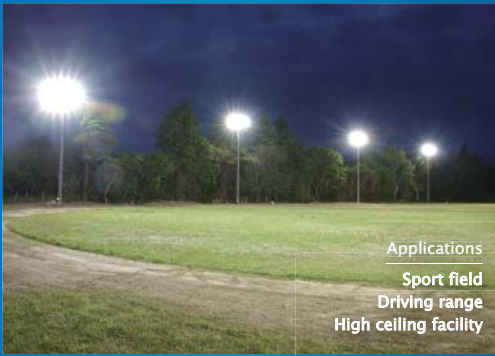
Applications Sport field Driving range High ceiling facility

Alder 500W High Bay Light with excellent thermal management, system efficacy reach 156 lm/W. With the features of light-weight, different mounting options and longer time service, it delivers the benefits of less maintenance and more economical solution. Ideal applications are for factories, sport fields, warehouses and distribution centers.